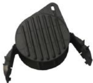
Protection box to be clipped on 5/35