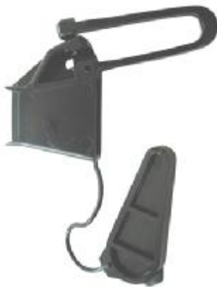
Drop wire clamp 5/35